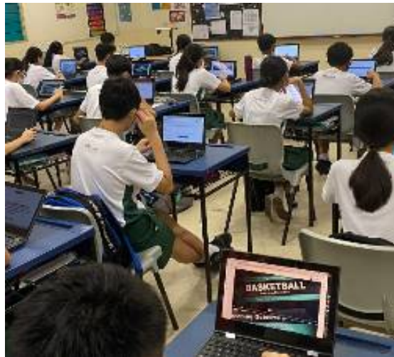
Support Self-Directed and Collaborative Learning