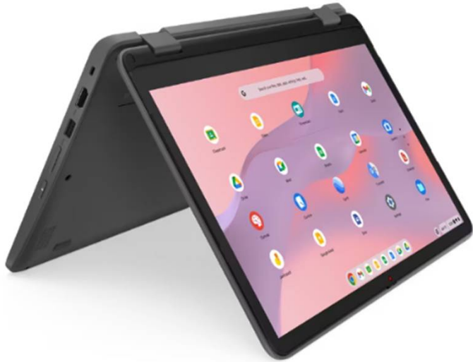
Enhanced Lenovo 500e Gen 4