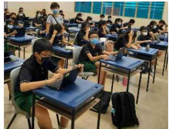
Enhance Teaching and Learning