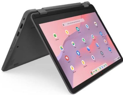
Lenovo 500e Gen 4

no subsidy will be provided. Parents/Guardians can use their child's/ward's Edusave or cash to defray the device bundle cost.