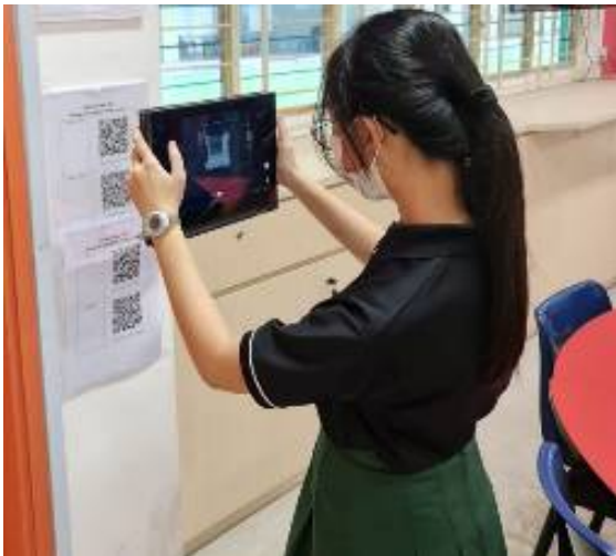
Support the Development of Digital Literacy

The use of the PLD for teaching and learning aims to: